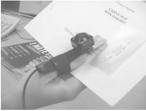
Fig. 1. One of the user's hands holding a tagged paper document.

As illustrated in Fig. 1, the object location tracking system consists of (1) an office environment containing RF/ID-tagged artefacts, (2) wearable wireless tag readers, placed on each of the user's hands, identifying any tagged object the user takes in their hand, and (3) a wireless location transmitter always aware of the positions of the user's hands.