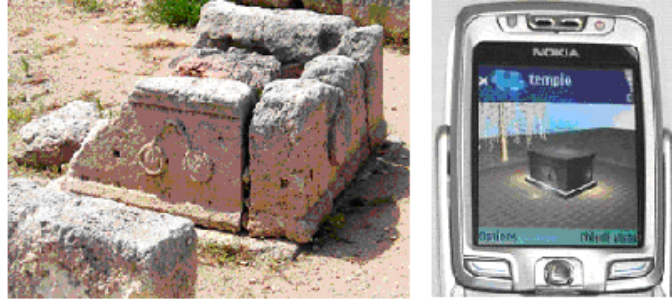
Fig. 3. The remains of the temple (left) and a phone 3D reconstruction of how it probably looked two thousands years ago (right).

and the whole school class is encouraged to participate and collaborate.