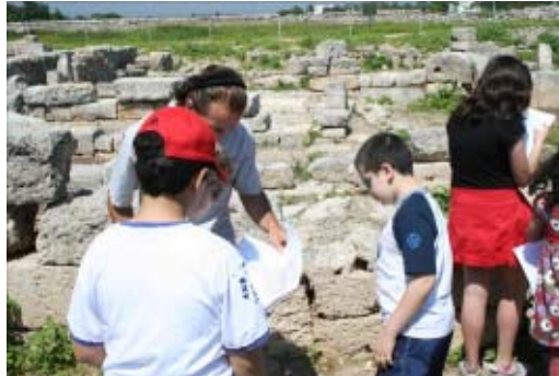
Fig. 2. The student groups carry out the game.

Groups of 4/5 players are formed: each group has a navigator (group leader) and impersonates a Roman family that has just arrived in Egnathia, having received a plot of land and a house. The experience with the paper version of the game has shown that playing historical roles strongly motivate students. Each group has to explore Egnathia by collecting information, identifying places and noting them down on a map of the park (Fig. 2).