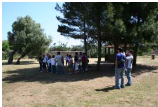
Fig. 1. Students listening to the game master at the archaeological park.

We made use of the contextual inquiry technique to collect data about users' own activities [2, 7]. We participated in an actual excursion-game performed at Egnathia by students (11-12 years old) of the middle school "Michelangelo" in Bari, Italy. The pictures shown in the paper were taken during that visit.