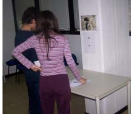
Fig. 6. The participants in the pilot study during the execution of the electronic game.

The first user evaluation revealed some usability problems, such as the absence of feedback in case of system delay. This is a particularly important aspect when interacting in a mobile context. We have therefore improved the system by sending visual and sound messages that warn the user about what is happening. In addition, we introduced the possibility to undo previously performed actions.